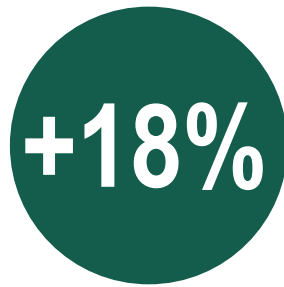
EBS Survey Data Feedback from individual staff showing a significant increase in staff confidence in PBL implementation at our school. In place signifies those systems are fully implemented.